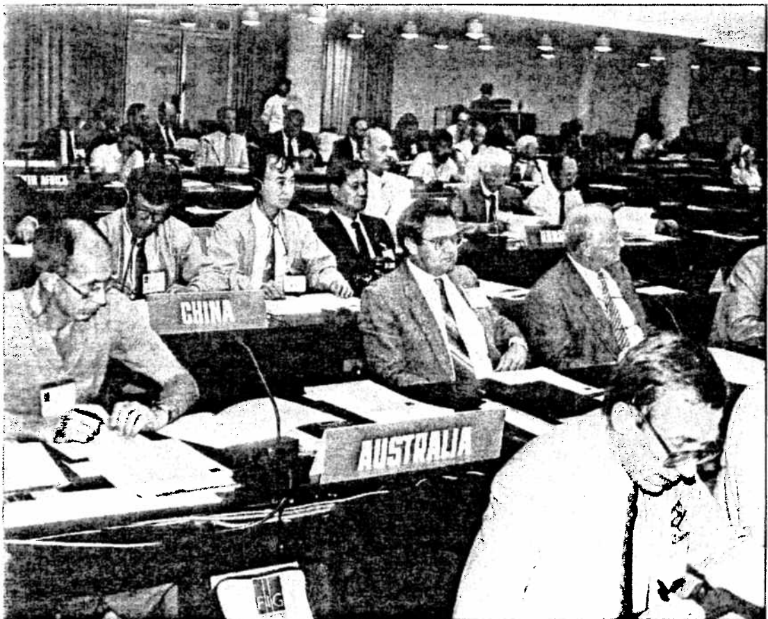
The General Assembly Meeting held in conjunction with the Helsinki Congress in 1990.