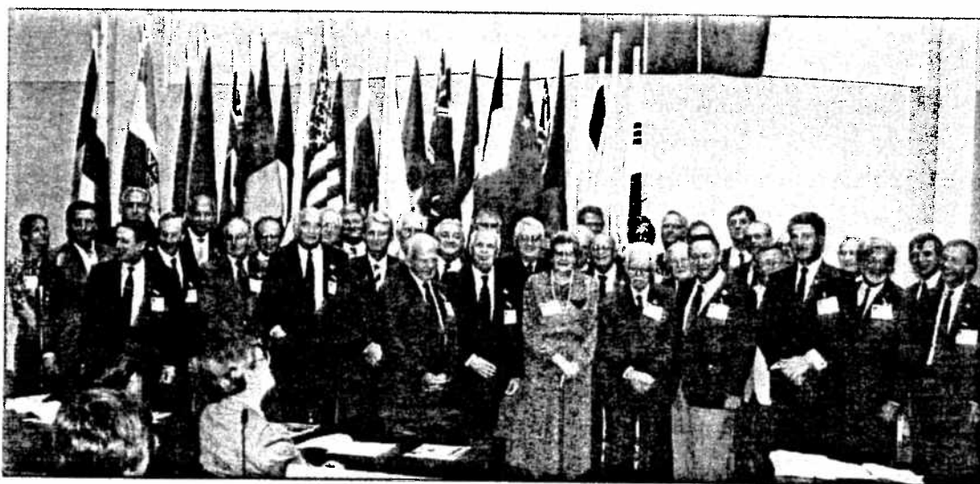
FIG Honorary Presidents, Honorary Members, former and present Commission Chairmen and Bureau members gathered at the Helsinki Congress after having received honorary badges.

(f) A plebiscite of member associations to evaluate their willingness to subscribe additional funds for the purpose of improving communications and the undertaking of projects, such as Student Exchange programmes, as suggested in (b).