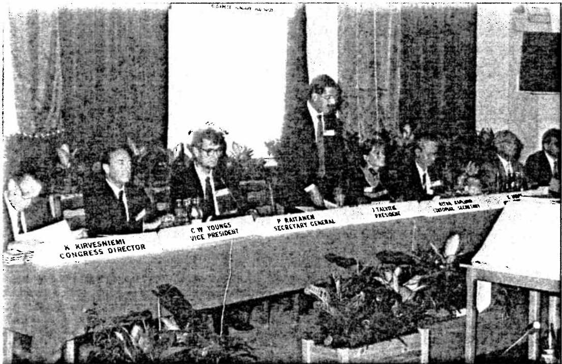
The Finnish FIG Bureau (1988—1991) at the PC Meeting in Hungary in 1989.