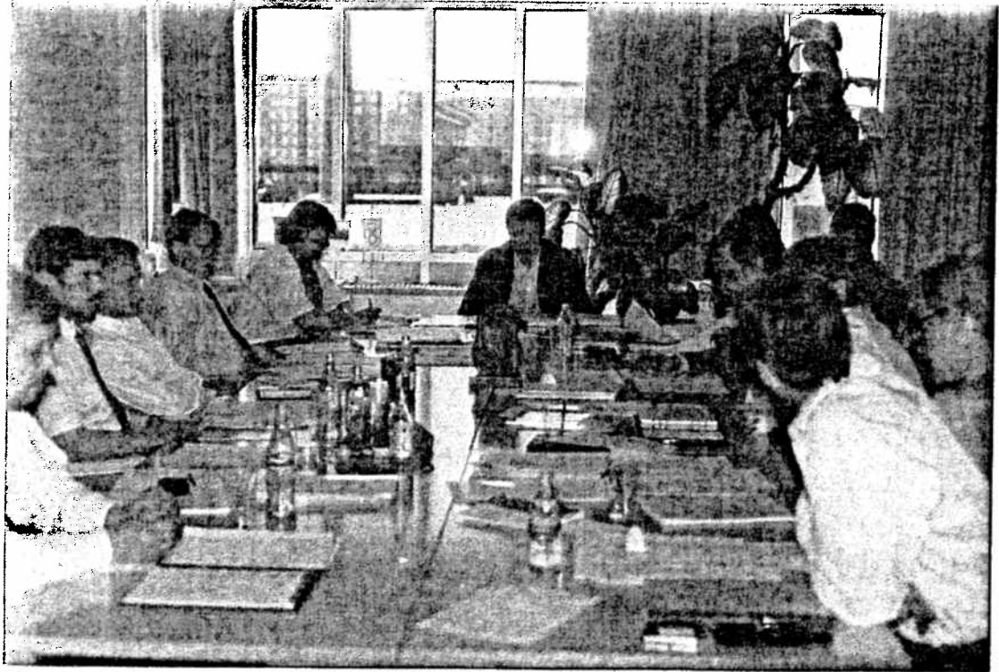
Meeting of the Committee of the Association of Finnish Surveyors (MIL).