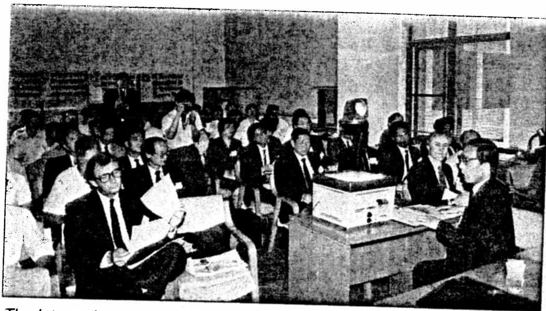
The International Symposium organised in conjunction with the 58th Permanent Committee Meeting held in Beijing, China in 1991.

Another area of importance that was revealed by the special session in Helsinki was a desire by member associations to become more involved with other member associations within their own area of influence. Suggestions were made for the sponsoring of new member associations by neighbouring members and for assistance to form professional associations in countries that do not have them. These are projects that can only be carried out by and for countries in close proximity to each other – i.e. within the same geographic region.