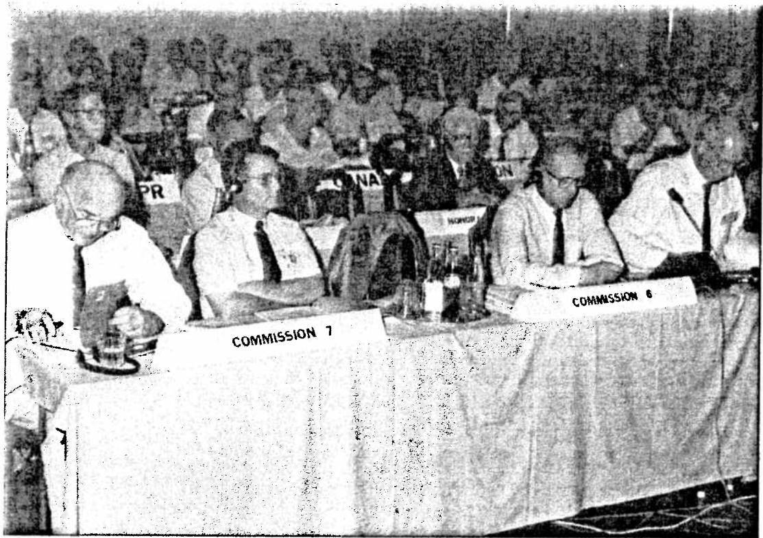
The 56th Permanent Committee Meeting held in Budapest, Hungary, in 1989.